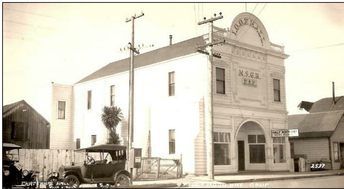
MAIN STREET early 1900's