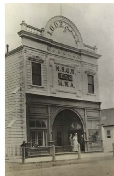
ORIGINAL BUILDING constructed 1894